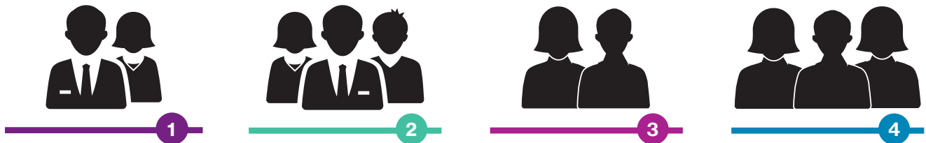
Figure 2. Survey Respondents Groups