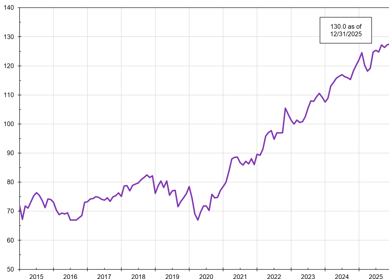
WTW Pension Index

The WTW Pension Index has increased for the third month in a row in December 2025. The combination of small investment returns and decreases in liabilities due to increases in discount rates resulted in a December 31, 2025 index level of 130.0, an increase of 1.9% over the prior month.