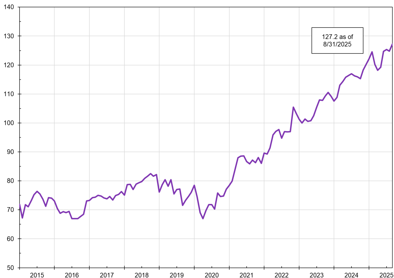
WTW Pension Index

The WTW Pension Index has increased in August 2025 after seeing a decrease in July. The increase in liabilities was more than offset by the positive investment returns in the benchmark portfolio, resulting in an August 31, 2025 index level of 127.2, an increase of 1.9% from the prior month.