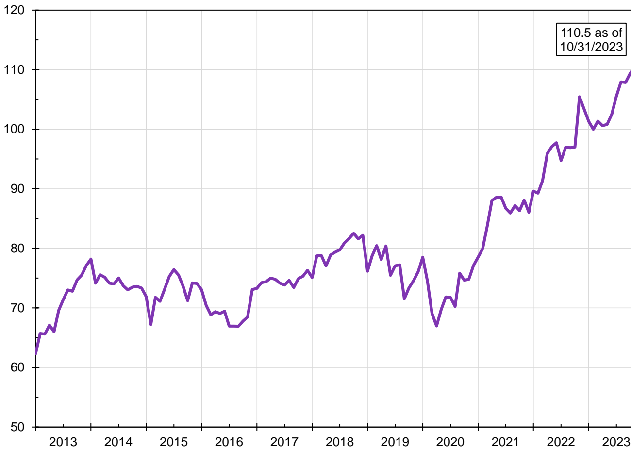
WTW Pension Index

The WTW Pension Index continued to increase in October 2023, once again reaching its highest level since mid-2001. Reductions in liabilities as a result of further increases in discount rates were slightly offset by negative investment returns, raising the October 31, 2023 index level to 110.5, an increase of 1.1% for the month.