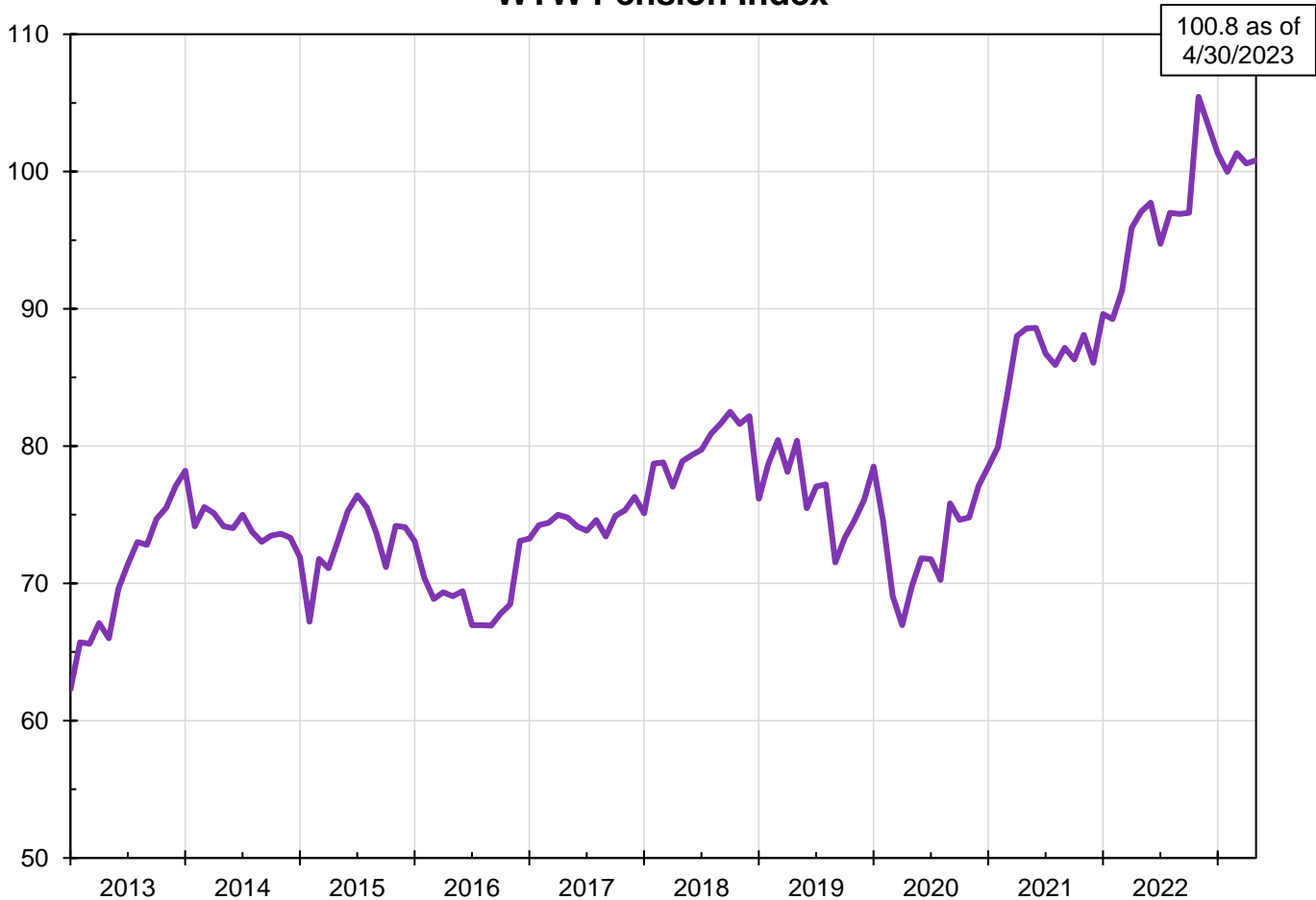
WTW Pension Index

The WTW Pension Index increased in April 2023. The increase was a result of positive investment returns, partially offset by an increase in liabilities due to a small decrease in discount rates. As a result, the April 30, 2023 index level of 100.8 reflects an increase of 0.2% for the month.