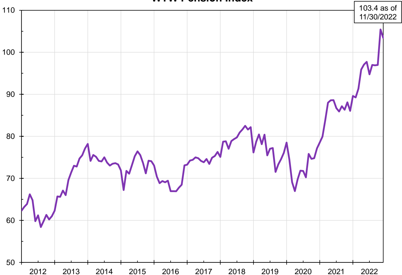
WTW Pension Index

After a sharp increase in its value in October, the WTW Pension Index declined in November 2022. This month's change was a result of an increase in liabilities due to a decrease in discount rates, partially offset by strong investment returns. As a result, the November 30, 2022 index level of 103.4 reflects a decrease of 1.9% for the month.