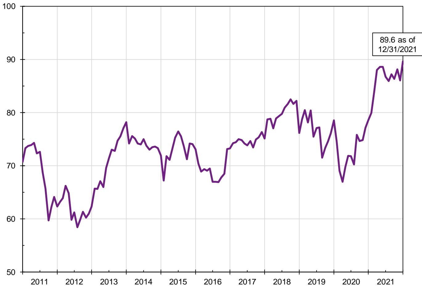
Willis Towers Watson Pension Index

The Willis Towers Watson Pension Index ended the year on a positive note, increasing to levels not seen since May 2008. This was primarily due to strong equity investment returns, aided by increased discount rates. The end-of-December index level of 89.6 reflects an increase of 4.1% for the month and 14.2% for the year.