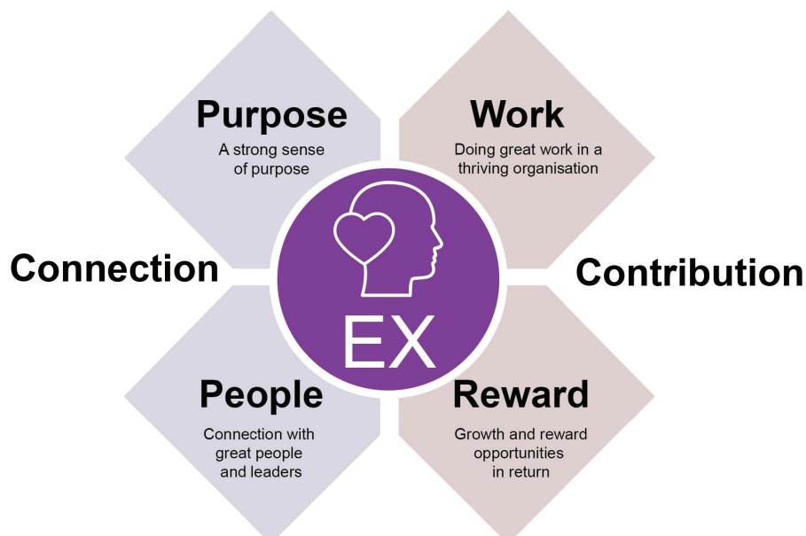
Figure 1: Dimensions of EX: Fundamentals that employees are looking for at work

on their EX index scores, we could predict whether they outperform, or underperform, their sector. That's quite powerful, as it goes beyond an intuitive or anecdotal perspective of how the employee experience drives organisation performance. Indeed, these pillars are fundamental to get right to drive a high-performance employee experience (and financial performance)!