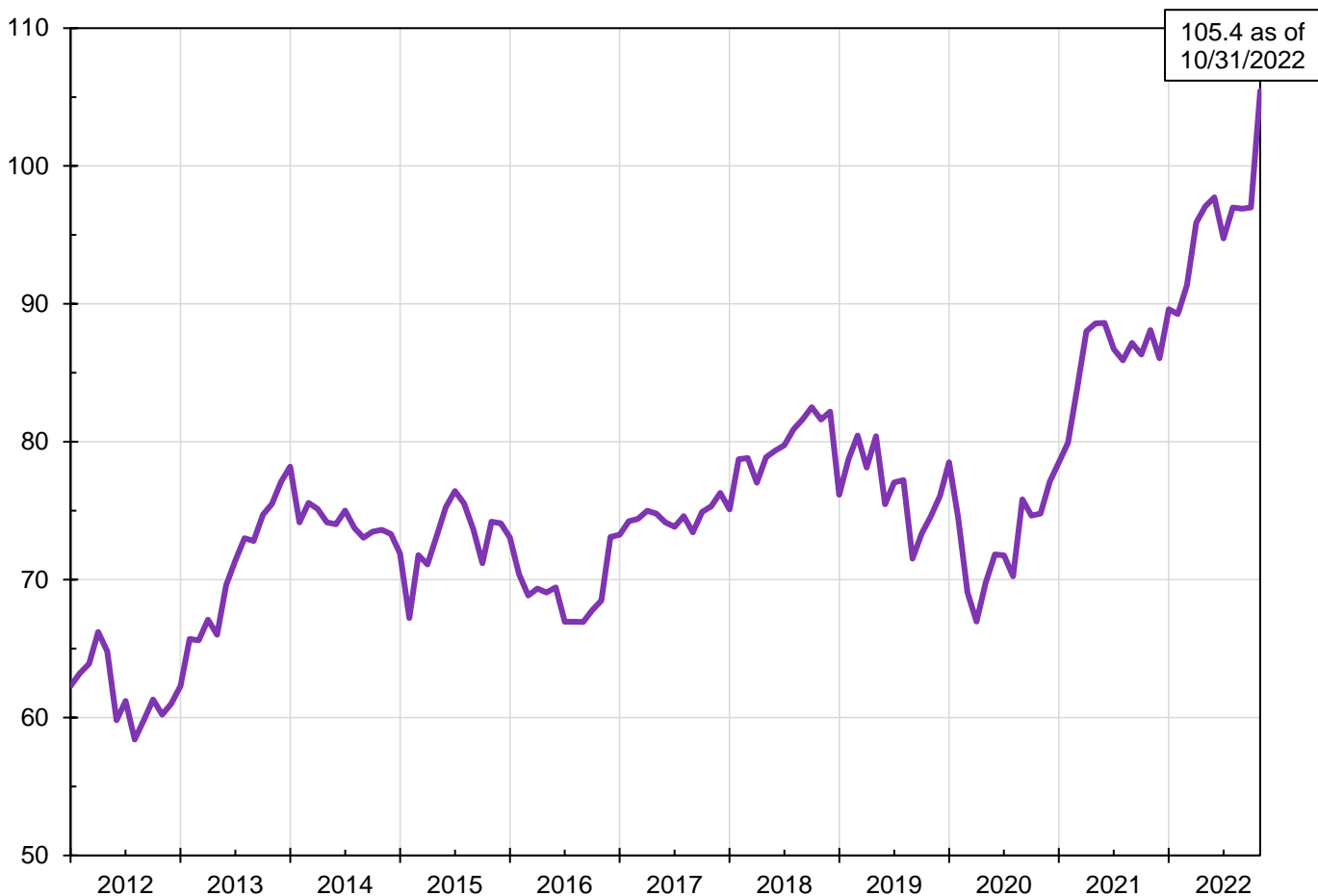
WTW Pension Index

The WTW Pension Index in October 2022 increased to the highest level it has seen in over two decades, despite the volatility seen in the month. Strong investment returns were combined with the reduction in liabilities due to a continued increase in discount rates. As a result, the end-of-October index level of 105.4 reflects an increase of 8.7% for the month. This is the first time the hypothetical plan represented by the index has achieved full funding since March 2002.